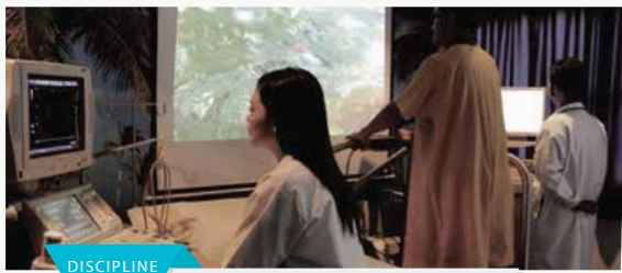
DISCIPLINE 01 CARDIOVASCULAR TECHNOLOGY